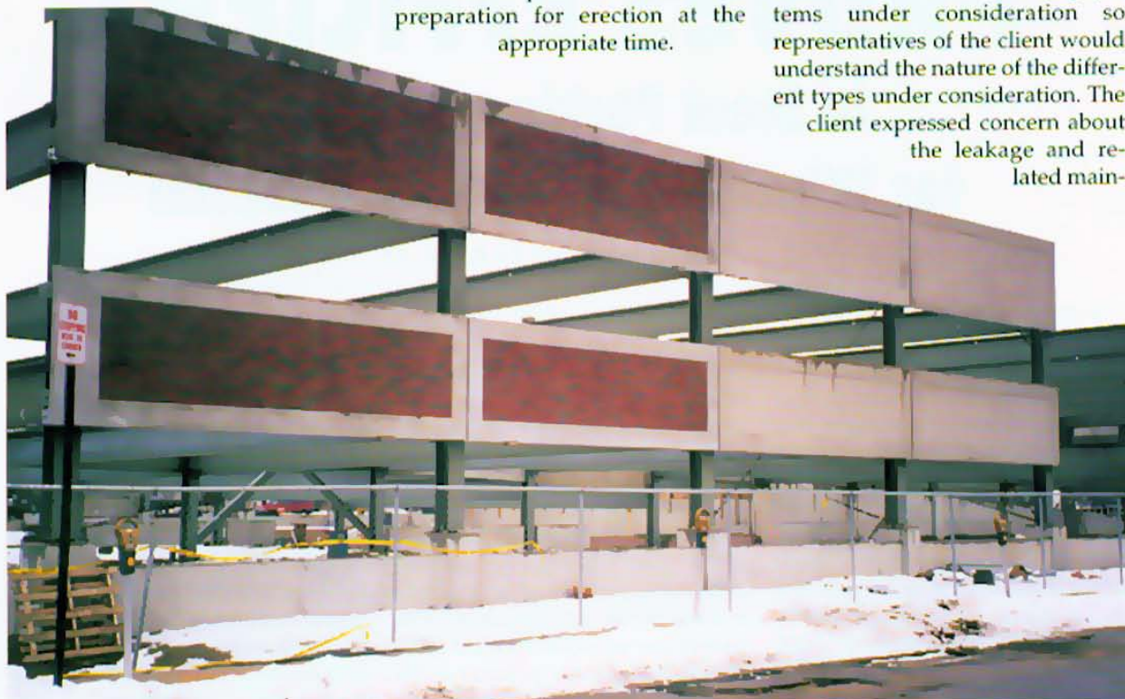
The partially erected structure showing both the brick faced and plane P/C panels used as a façade treatment.

Prior to selecting a structural framing system for the project, CWCG and CWI evaluated alternative systems, including precast concrete, cast-in-place post-tensioned concrete and the steel framed system ultimately selected. Field visits were conducted to existing structures with the various framing systems under consideration so representatives of the client would understand the nature of the different types under consideration. The client expressed concern about the leakage and related main-