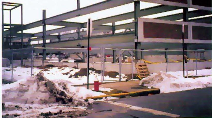
A view of the partially erected steel frame with the P/C concrete panels placed at the exterior for a façade treatment. Note the composite studs affixed to the top of the beams to tie in the concrete deck.

At the beginning of the project, CWI focused on the foundation requirements while CWCG got the steel ordered, the fabrication