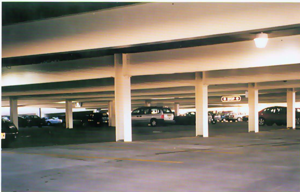
An interior view shows the openness created by the steel framing system. Also note the large deck area free of joints and cracks.

number of measures designed to reduce the probability of future corrosion of the system.