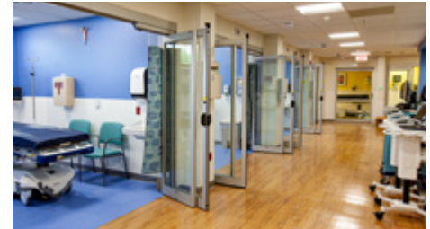
Emergency Room Expansion Good Samaritan Hospital

2021 Best in Show and 1st Place, Permanent Modular – Healthcare