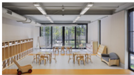
Childcare Center Lehman College

2014 1st Place, Permanent Modular – Education