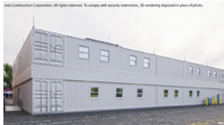
Crew Assembly Building U.S. Navy

2023 1st Place, Relocatable Assembly Over 10,000 Square Feet