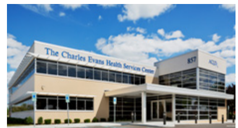
Charles Evans Health Center ACLD